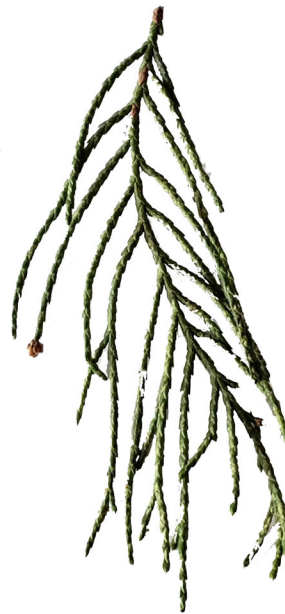
Rocky Mountain Juniper