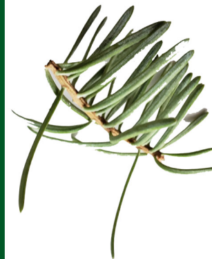
Utah White Fir