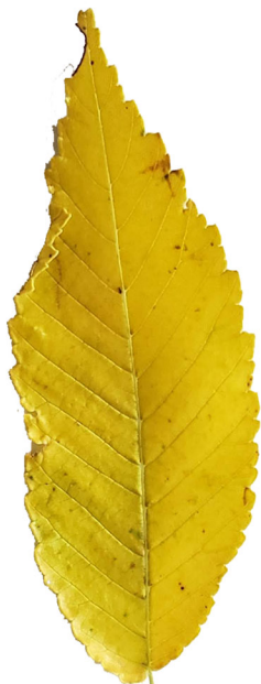
Siberian or Chinese Elm