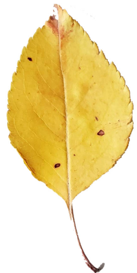
European Crab Apple