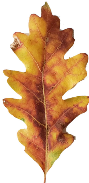
Gambel or Scrub Oak